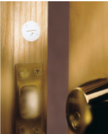
THE MICRO RECESSED DOOR/WINDOW SENSOR