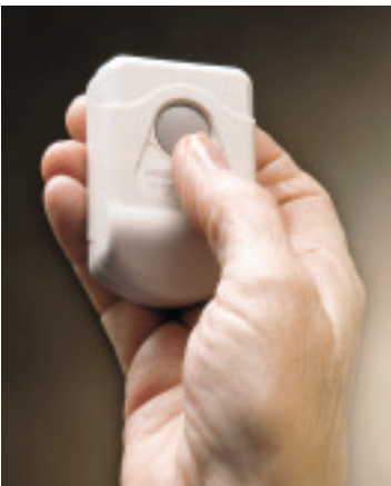
THE WATER-RESISTANT PANIC BUTTON

The Quik Bridge Two-Channel Receiver lets you customize the panel specifically to customer needs. You can combine up to four wireless sensors or keychain touchpads with the hardwire system. You have all the versatility you need to make improvements your customers will really appreciate.