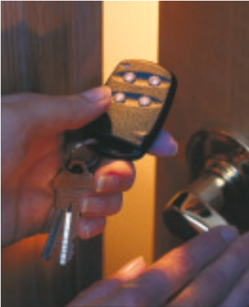
THE WIRELESS KEYCHAIN TOUCHPAD